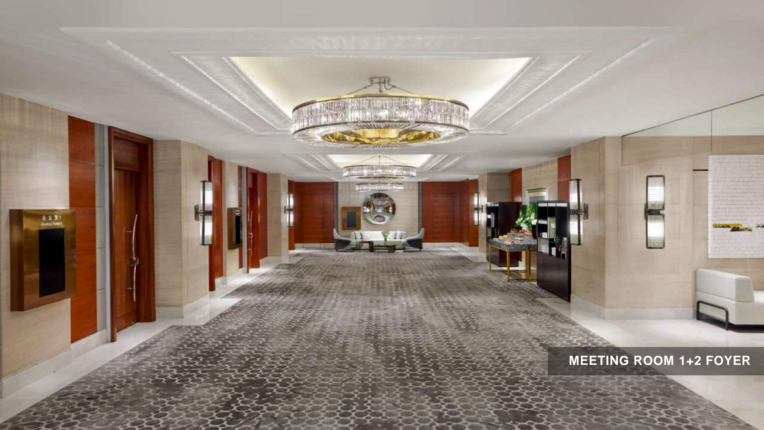
MEETING ROOM 1+2 FOYER