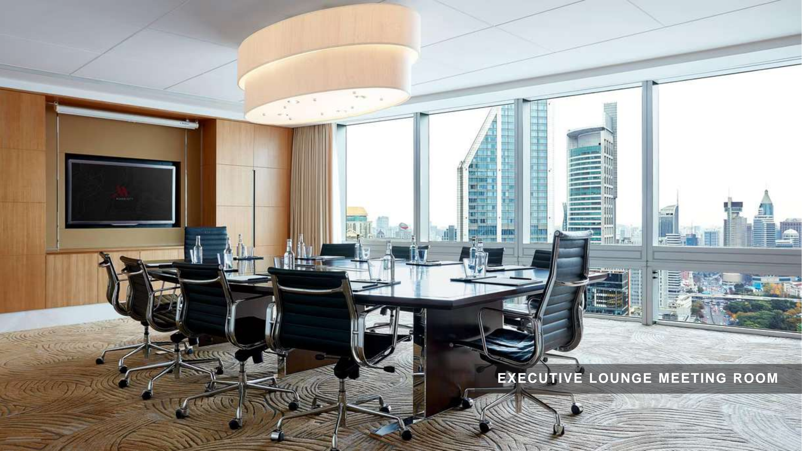
EXECUTIVE LOUNGE MEETING ROOM