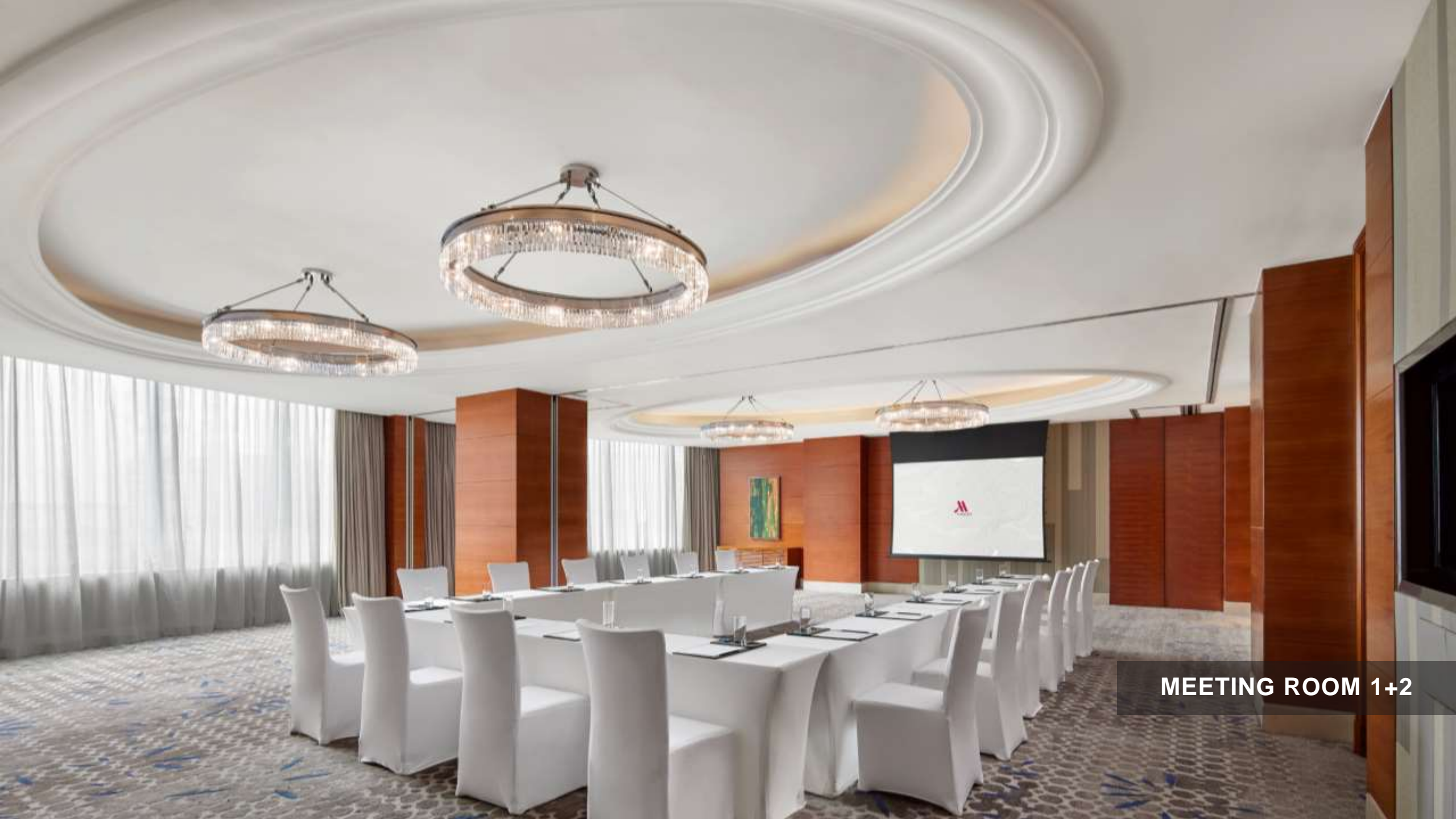
MEETING ROOM 1+2