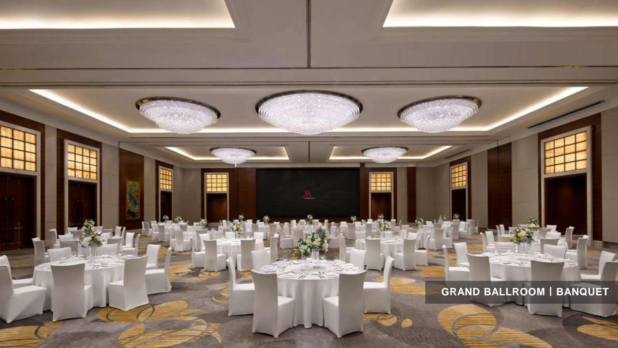
GRAND BALLROOM | BANQUET