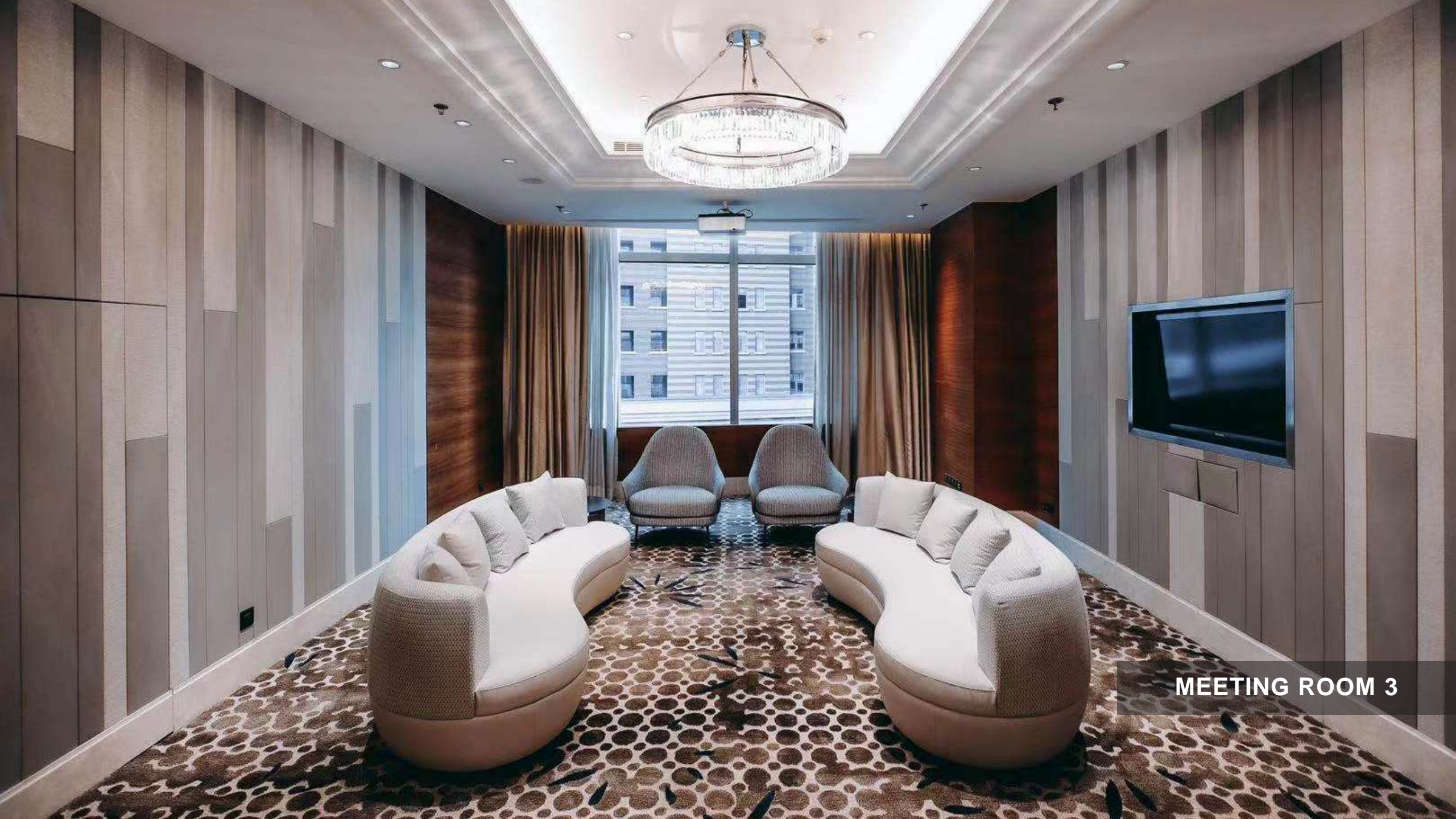
MEETING ROOM 3