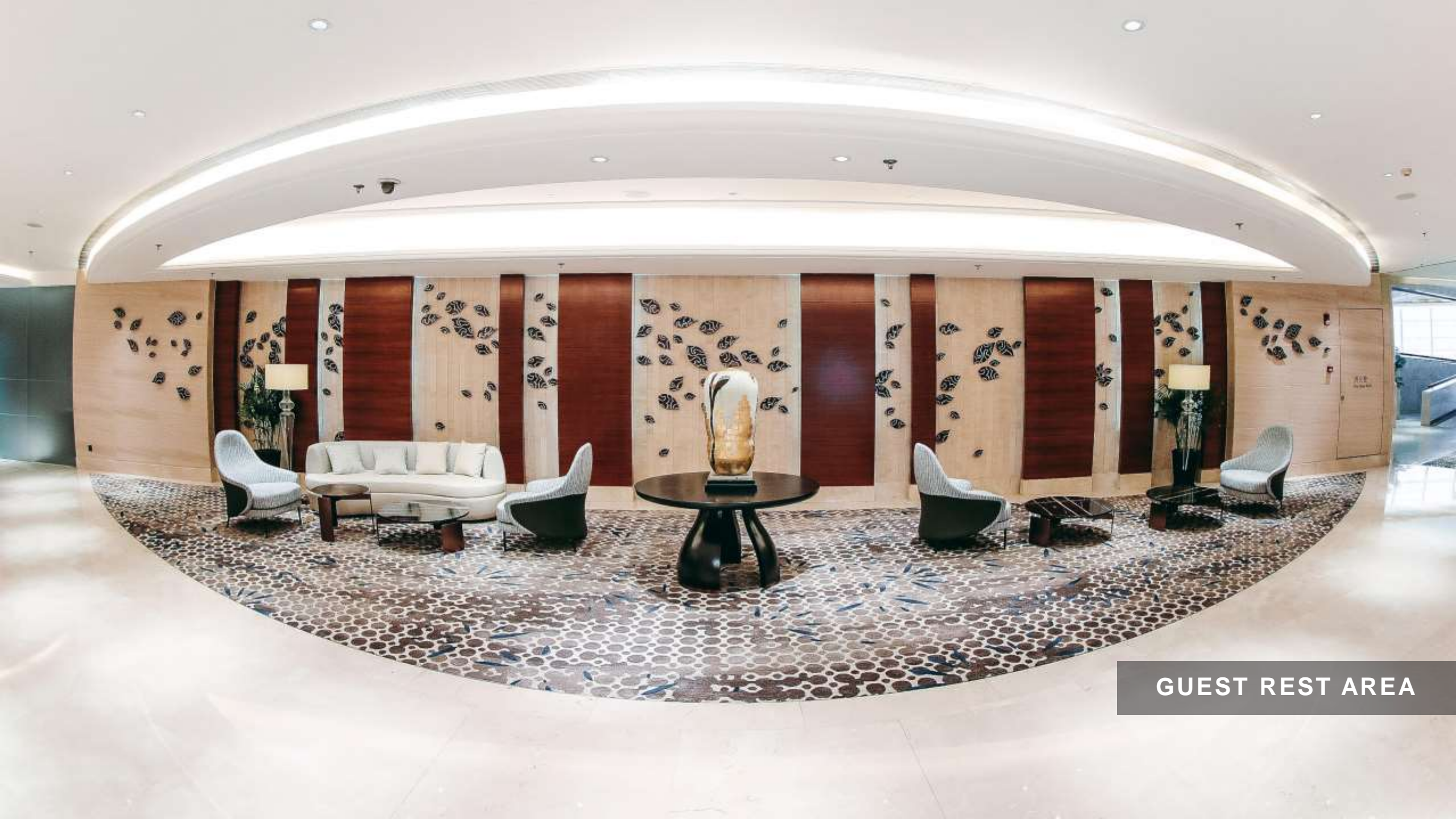
GUEST REST AREA