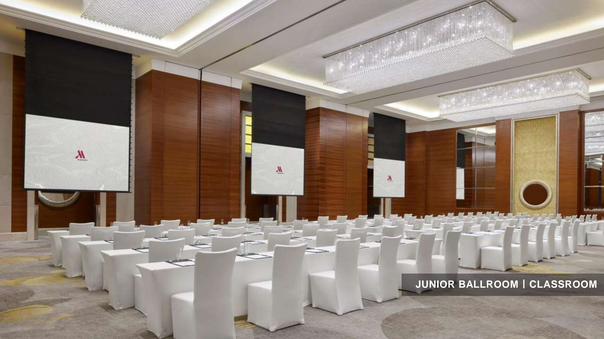
JUNIOR BALLROOM | CLASSROOM