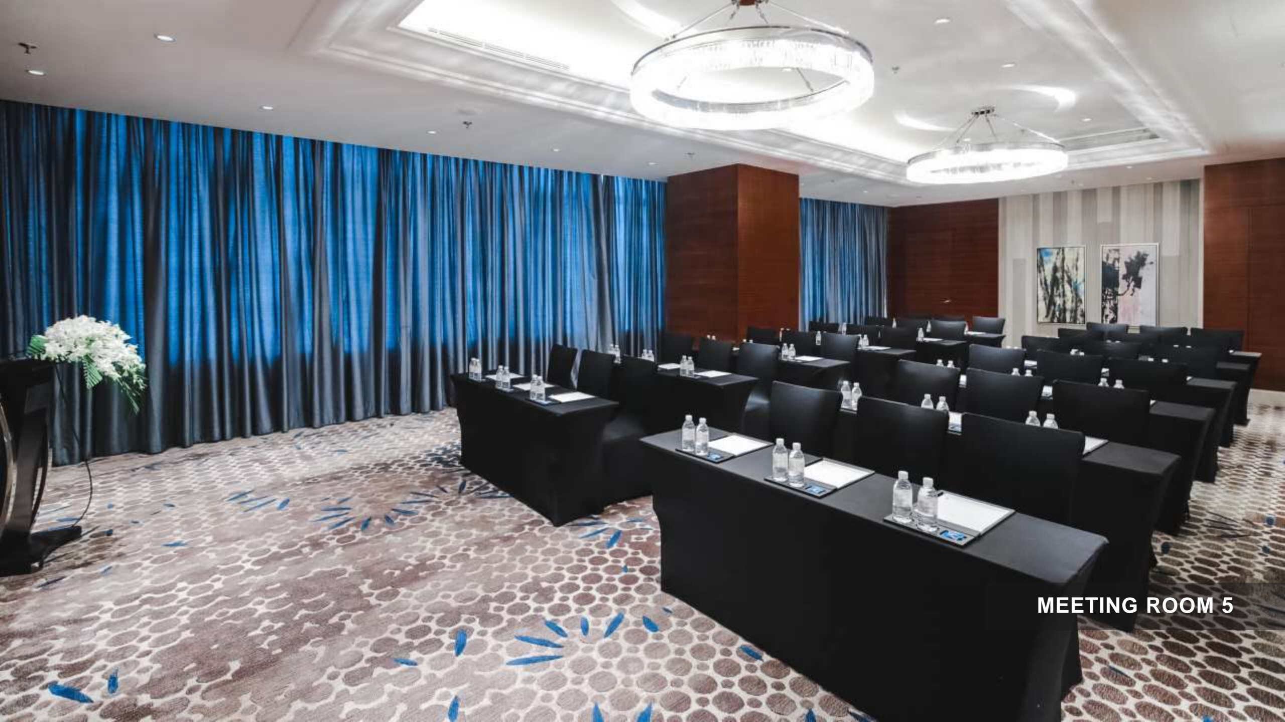
MEETING ROOM 5