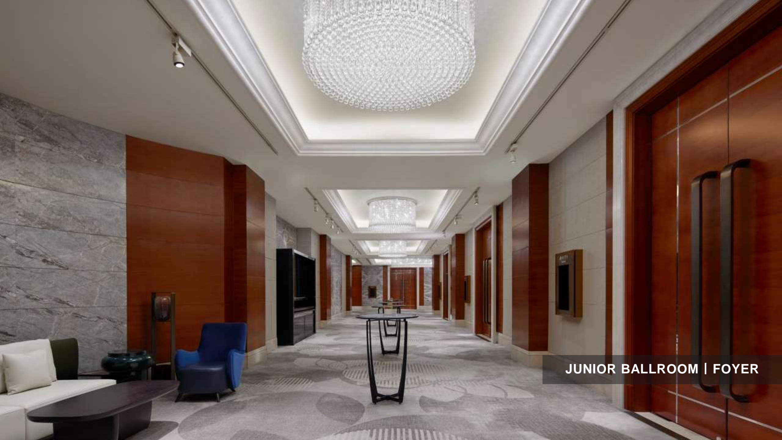
JUNIOR BALLROOM | FOYER