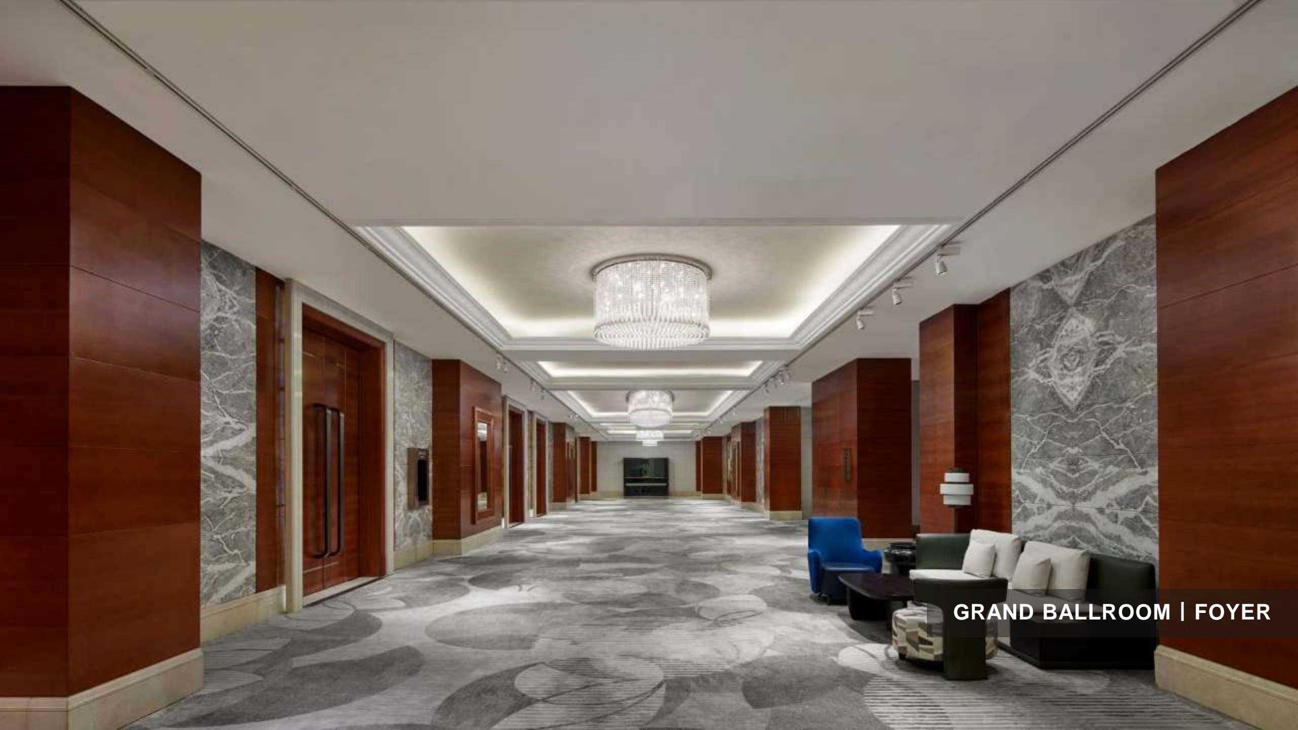
GRAND BALLROOM | FOYER